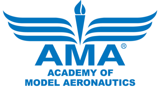
Table & Booth Details